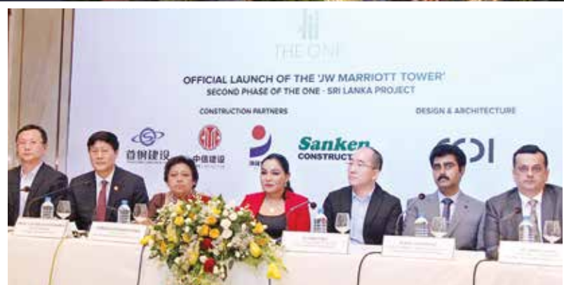
The One Transworks Square officially launched Phase Two of high end luxury development - Second tower, JW Marriott Hotel, Residences & Retail.